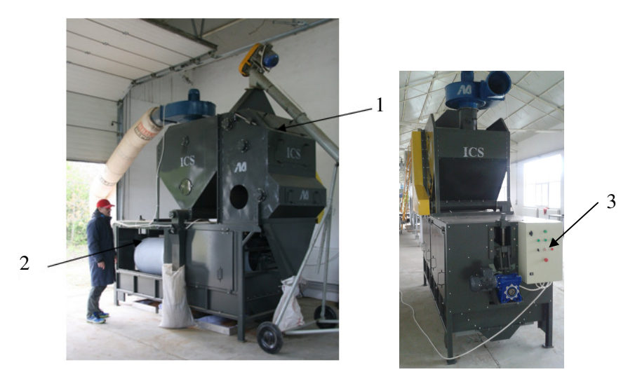
Fig. 2. Seed conditioning installation ICS: 1 – seed pre-cleaning module MPS-0; 2 – cylindrical sieve SC-0; 3 – drum tilting mechanism

The product, precleaned of raw foreign bodies and light impurities, reaches the cylindrical sieve where the separation in several fractions takes place. The sieve drum receives the rotation movement from a shaft gear motor. In the working process, the seeds with smaller size than the holes will go through them and those remaining as plus material will pass on the second sieve (if the cylindrical sieve is equipped with cylindrical sieves of different sizes, the smallest size being toward the supply). Some of them will pass through the holes of the second sieve (if they have the sorting size smaller than holes) and those that will remain as plus material will go to the third sieve. On this sieve the seeds having the sorting size smaller than the sieve holes will go through and the ones remaining as plus material will be evacuated through the discharge hopper. Due to the complete range of available